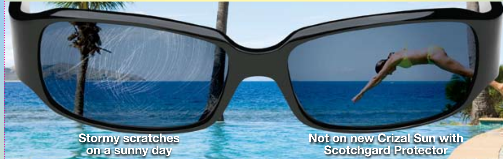
Stormy scratches on a sunny day