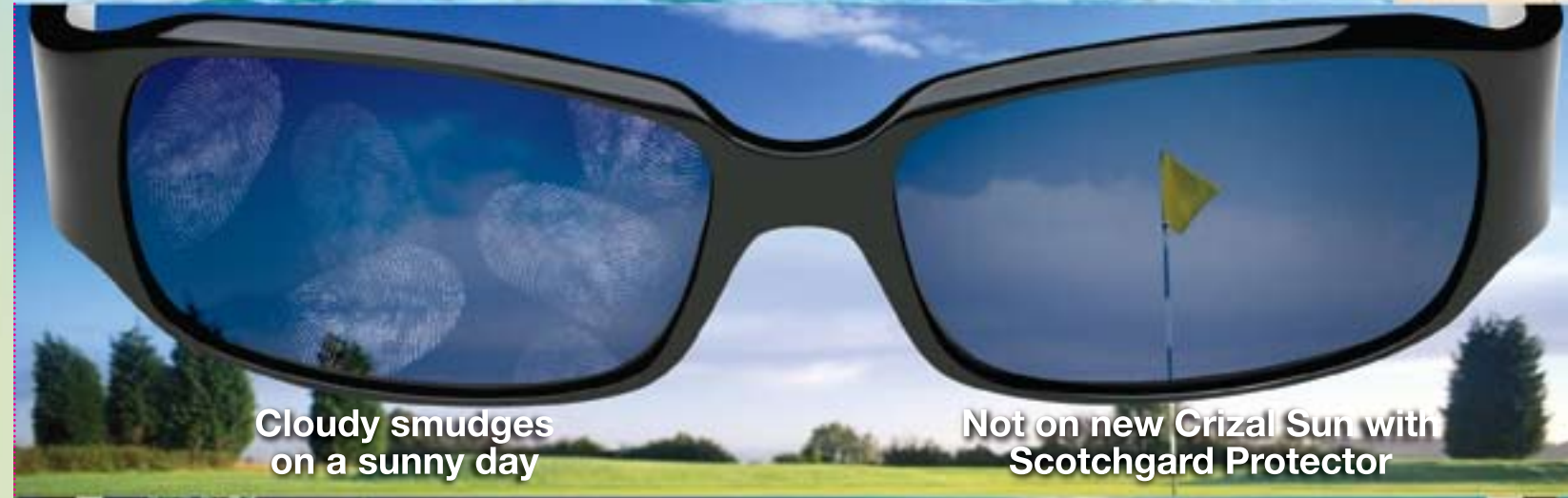
Cloudy smudges on a sunny day