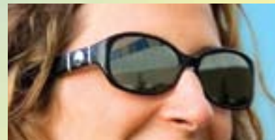
Silver (Gray 3 polarized or solid tint)

Crizal Sun Mirrors™ with Scotchgard Protector is available in three color options on polarized or solid tinted lenses