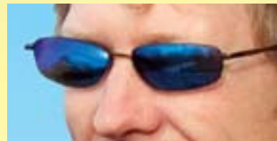
Blue (Gray 3 polarized or solid tint)