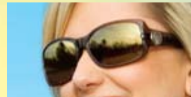
Gold (Brown 3 polarized or solid tint)