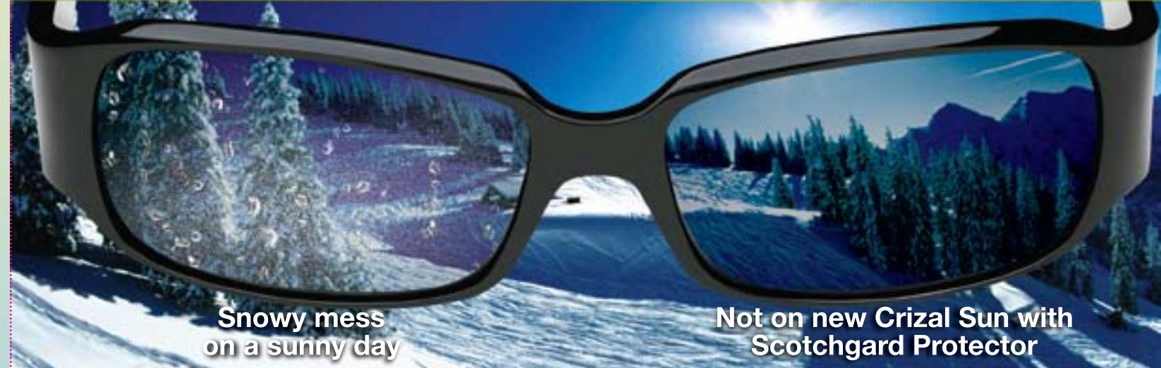
Snowy mess on a sunny day