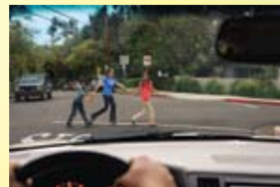
Crizal Sun on Xperio polarized lens

Xperio polarized lenses reduce glare while driving—even glare from the dashboard.